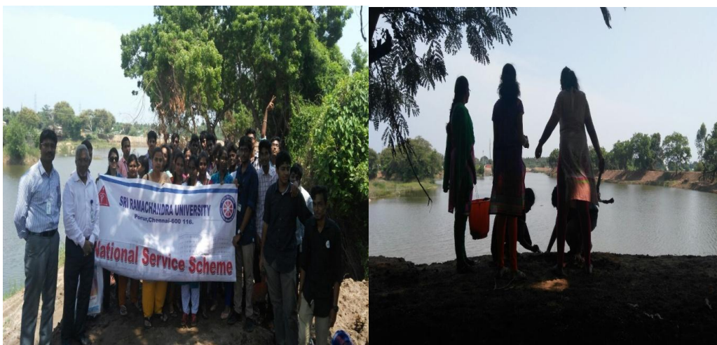
LAKE RESTORATION PROGRAMME AT KARASANGAL NEAR VANDALUR 1 st OCTOBER, 2016